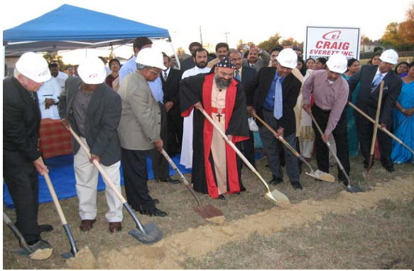
Ground-breaking ceremony held on 11/18/07

The Mar Thoma Church is an Eastern reformed Church with its head-quarters in Kerala, South India. The Church in India was founded by St. Thomas, the apostle of Jesus who brought the Gospel in 52 AD. The Mar Thoma Church belongs to this great tradition of apostolic origin as well as the reform movement of the early 19 th century. It is Apostolic in origin, Universal in nature, Biblical in faith, Evangelical in principle, Ecumenical in outlook, Oriental in worship, Democratic in function, and Episcopal in character. The motto "Lighted to Lighten" signifies the missionary nature of the Church.